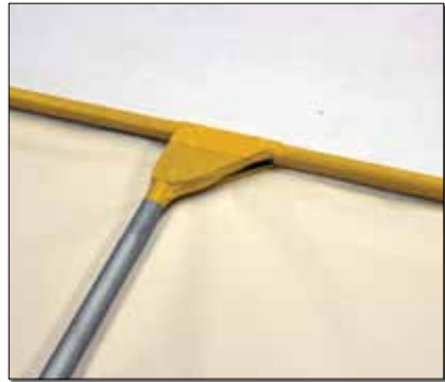
Fig. 5: This is how a completed section looks; it's important to go slow, apply pressure to the iron, and heat every square inch.

Lay the structure on the plain side of a fabric panel. Draw around the perimeter with a #2 pencil, then outline ribs or other structure that will also be glued to the fabric. Cut the panel to rough shape, leaving plenty of excess fabric (6 to 8 inches) outside the perimeter at curved sections. The excess offers something to grab and pull, as the fabric needs to be stretched around curved tubes. Brush a layer of adhesive just inside the perimeter line, several inches outside, and along the rib lines. The goal is simple; you want