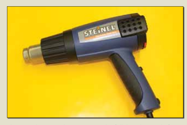
The Steinel HE2010E heat gun provides full digital control of output temperature, ranging from 120° F to 1150° F, in 10° F increments.

Everyone liked the Toko iron, but we found it had two drawbacks when applying Oratex to riveted aluminum structure. The baseplate incorporates channels with sharp edges intended to help spread ski wax. The channels tend to catch on protrusions like rivet heads and