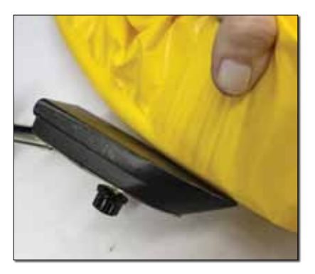
Fig. 6: On curved sections, pull the fabric with one hand while ironing it with the other.

Go slow, apply pressure to the iron, and be sure to heat every square inch. Straight sections are easy. Curved sections may require cutting small darts so the fabric will wrap without bunching.