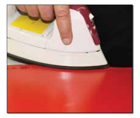
Fig. 9: When heat is applied to the center of the tape, it stretches enough to allow the non-heated, and now shorter, edges to lie down. They can be smoothed with an iron.

The Oratex process is, as promised, very clean. There is no smell or airborne vapor.