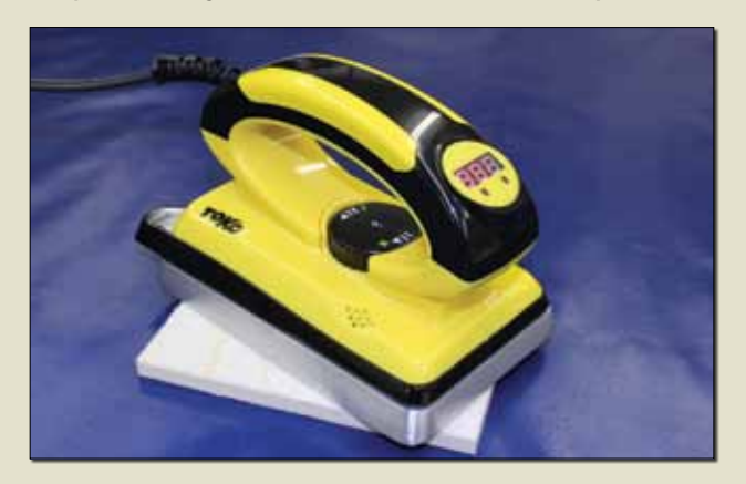
This Toko T14 digital iron was originally intended for applying wax to skis and snowboards. Its primary feature is extremely accurate temperature control.

A digital iron like the T14 controls temperature with a microprocessor rather than a thermostat. It has no low and high ON-OFF