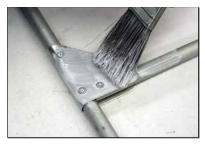
Fig. 1: After a thorough cleaning, scuff the parts to be covered with a mild abrasive, then apply Oratex adhesive with a brush.