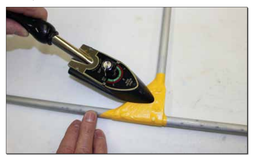
Fig. 3: Cut a patch of adhesive-coated fabric about a quarter-inch larger than the object to be covered and iron it into place.

The actual iron setting needed to get the glue to 158° F will vary depending on