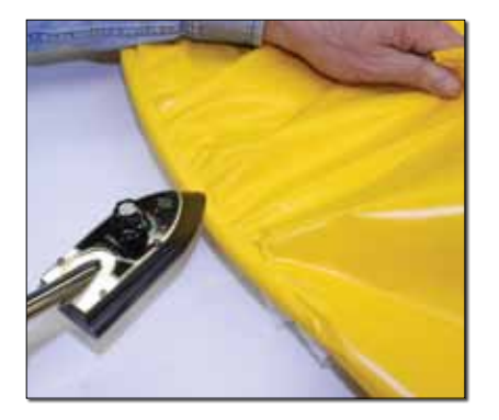
Fig. 7: With enough effort and heat, the fabric can be wrapped around compound shapes without puckering.

then brush on the adhesive and pull the tape while it is still wet. When the adhesive has dried, position the fabric and tack it with the iron along the straight sections. Trim to the desired overlap and iron down those sections. Now start pulling the fabric around the curved sections with one hand while ironing it with the other (Fig. 6).